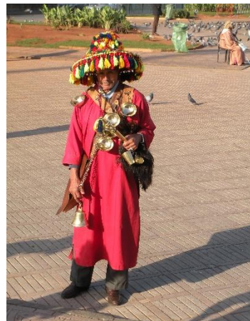
Casablanca Water Man